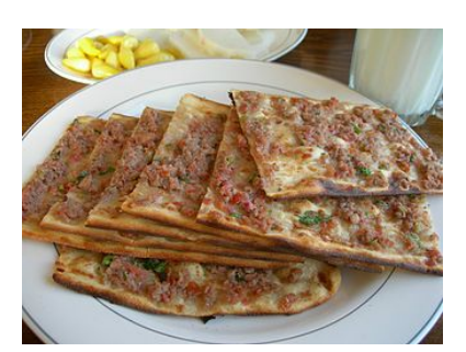
Etli ekmek is a local dish of Konya

Konya was the final home of Rumi (Mevlana), whose tomb is in the city. In 1273, his