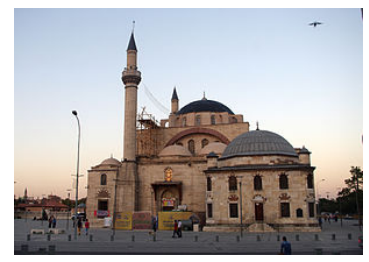
Selimiye Mosque (1558) in Konya

The local cuisine of Konya includes dishes made of <u>bulgur</u> wheat and <u>lamb meat</u>. One of the renowned dishes of the city is etli ekmek, which is similar to lahmacun and pizza. 10^{-51}