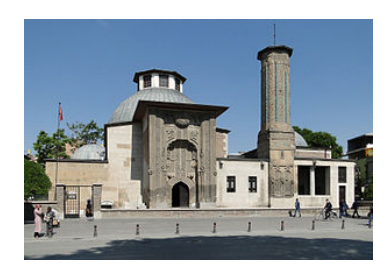
Ince Minaret Medrese (1279) in Konya

Alanya) and the Black Sea (including Sinop) and even gaining a momentary foothold in Sudak, Crimea. This golden age lasted until the first decades of the 13th century.