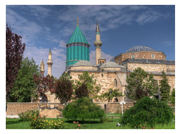
Mevlana Museum (1274) is the resting place of the Sufi mystic and poet Rumi in Konya, the capital of the Anatolian Seljuk Sultanate.

A <u>Turkish</u> <u>folk songs</u> is named <u>Konyalım</u>, <u>Konyalıya Güzel Derler</u> and <u>Konyalım</u> Yaman Calar Sak Sak Kasığı, making reference to a loved one from Konya. [50]