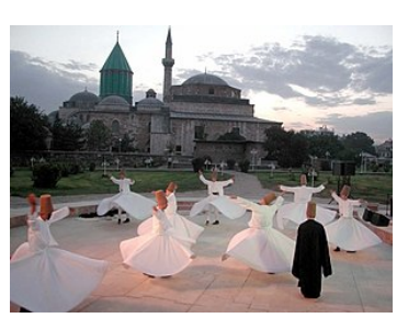
Established in 1273, the Sufi Mevlevi Order and its Whirling Dervishes are among the renowned symbols of Konya and Turkey.