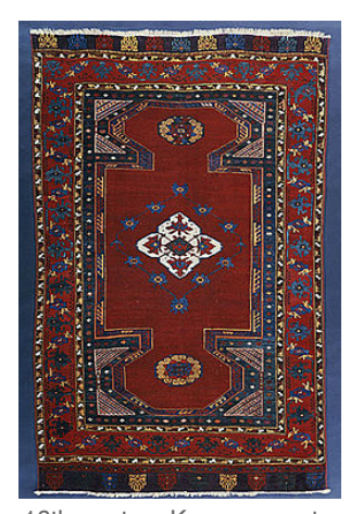
16th-century Konya carpet, in the collections of the Los Angeles County Museum of Art (LACMA).

Konya had a major <u>air base</u> during the Turkish War of Independence. In 1922, the Air Force was renamed as the Inspectorate of Air Forces<sup>[a]</sup> and was headquartered in Konya. <sup>[18][19]</sup> The Third Air Wing<sup>[b]</sup> of the 1st Air Force Command<sup>[c]</sup> is based at the Konya Air Base. The wing controls the four <u>Boeing 737 AEW&C</u> Peace Eagle aircraft of the <u>Turkish Air Force</u>. <sup>[20][21]</sup>