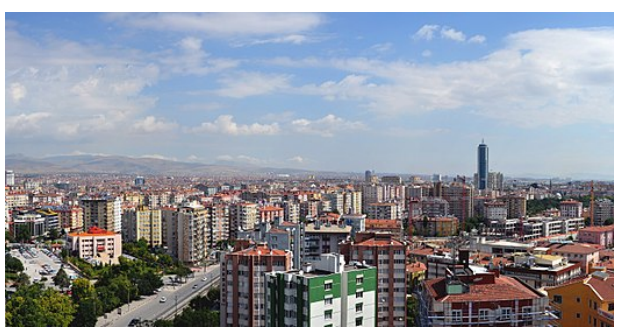
A panoramic view of the city from the Hacıveyiszade Mosque and citadel

Many Persians and Persianized Turks from Persia and Central Asia migrated to Anatolian cities either to flee the invading Mongols or to benefit from the opportunities for educated Muslims in a newly established kingdom. [17]