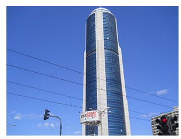
The 42-floor Seljuk Tower (2006) is the tallest building in Konya